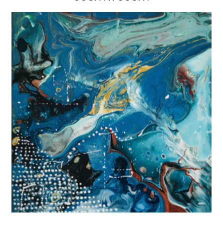
Fly Me to the Moon