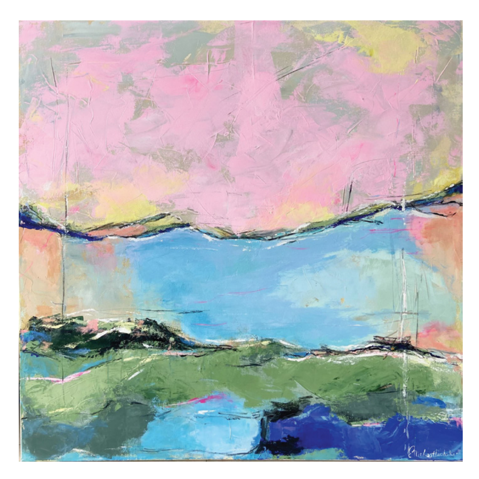
A Place of Hope Acrylics and Charcoal 92cm x 92cm