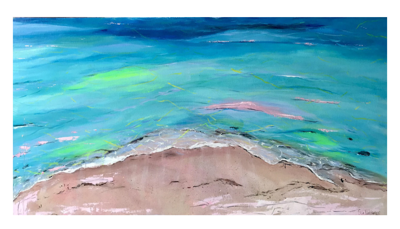
Scribbling on the Sweet Sand