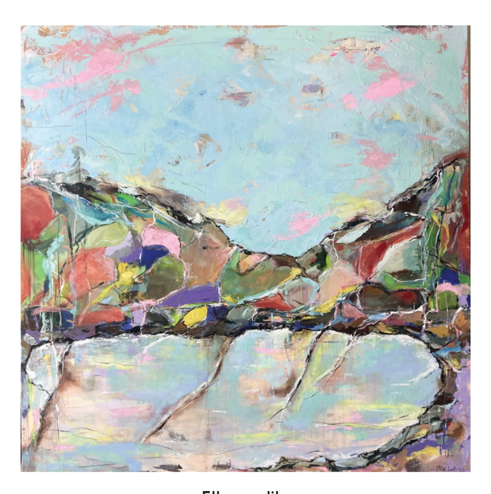
Ethereality Acrylics, Charcoal, Pastels 150cm x 150cm