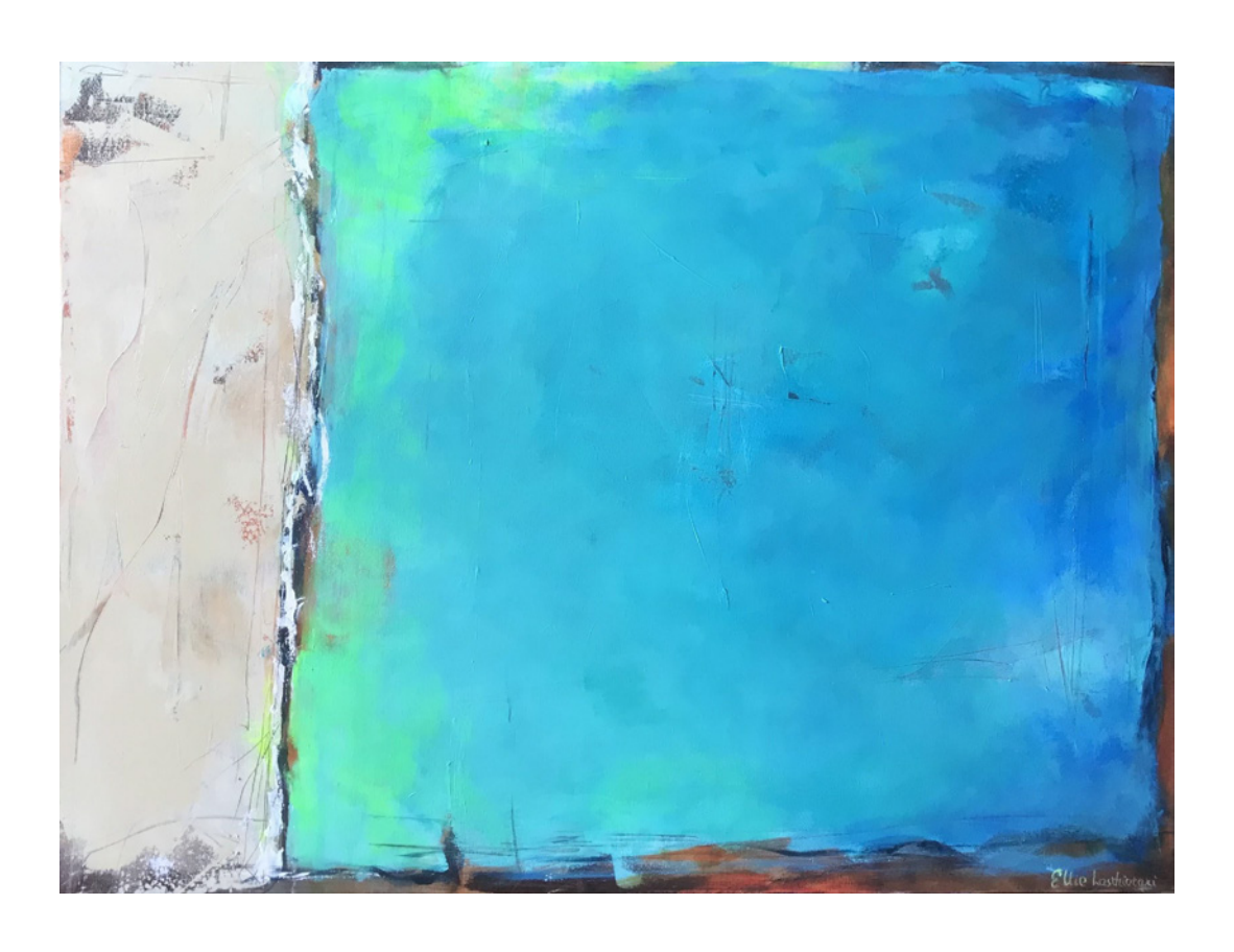
Lines of Existence