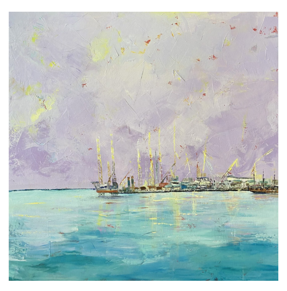
Harbour View Acrylics 92cm x 92cm