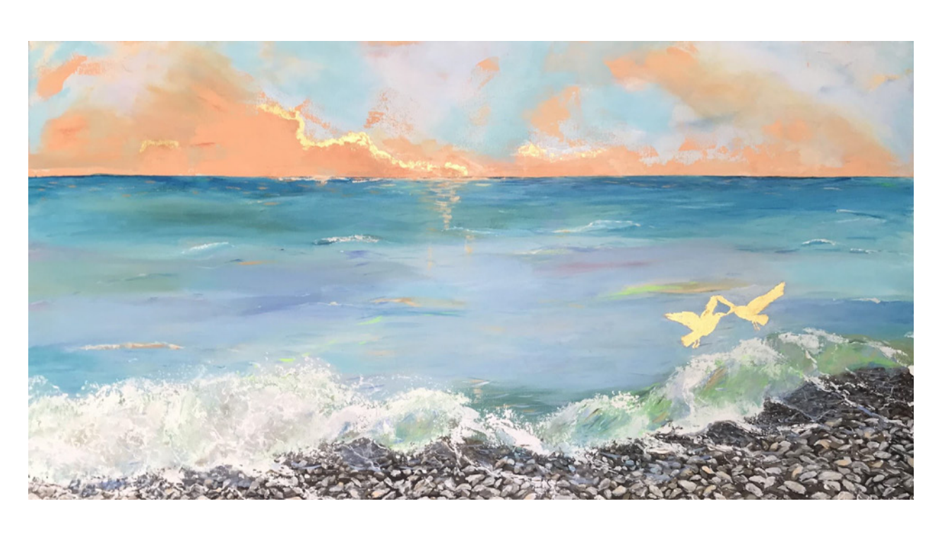
The Seagulls' Kiss