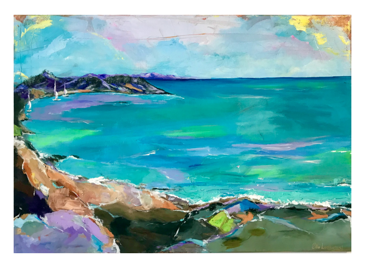
Echo of Gentle Waves