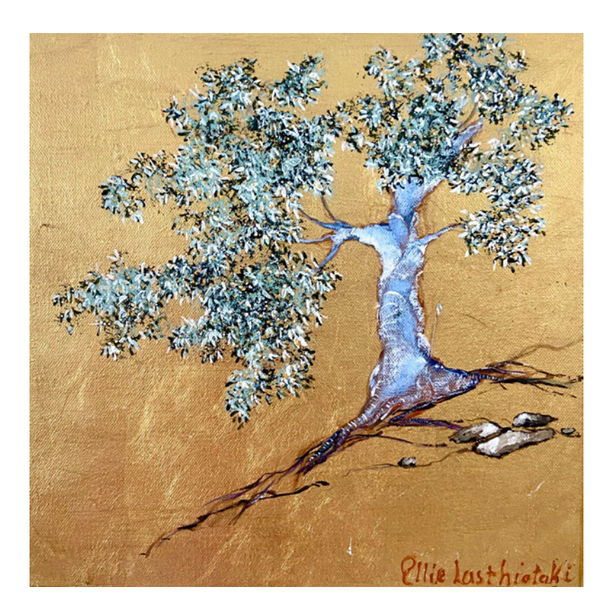
I Am Here For You