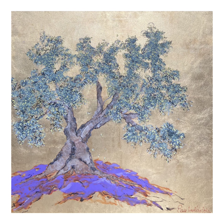
You Still Make My Heart Swing