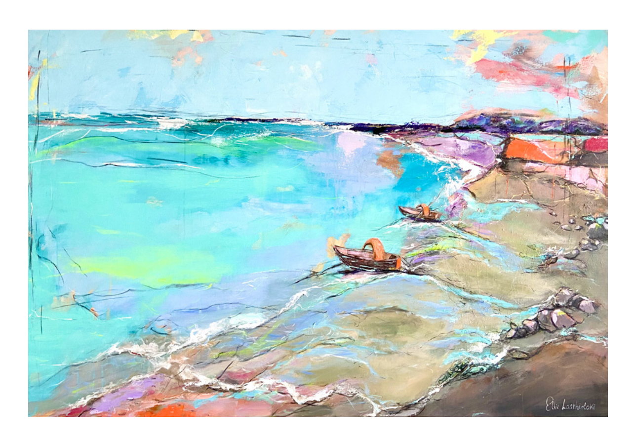
Ode to Glowing Memories of Elegance

Acrylics, Charcoal, Pastels 150cm x 100cm