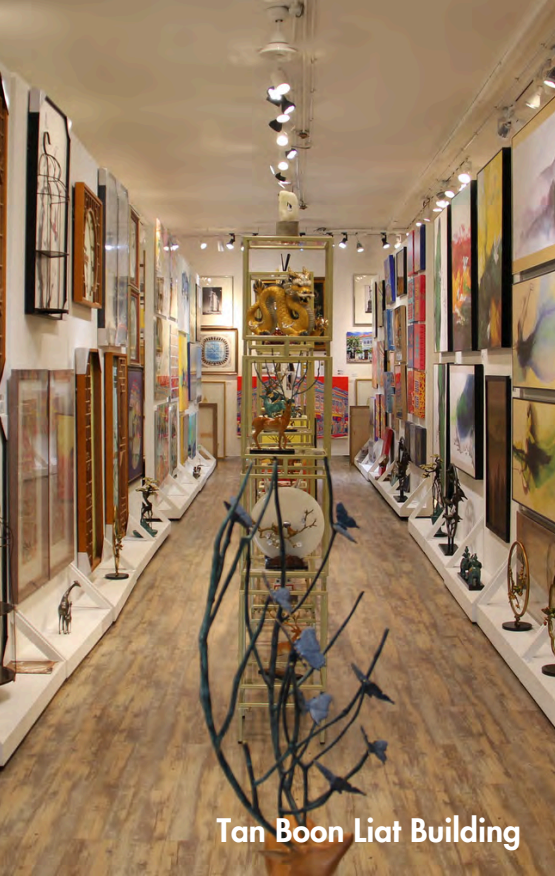
Tan Boon Liat Building